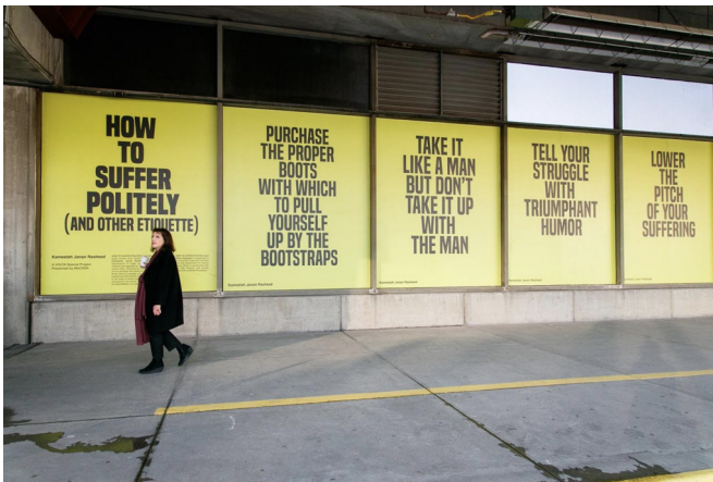
How to Suffer Politely (and other Etiquette) , a solo public installation as part of the VOLTA Art Fair (NY) presented by the Museum of Contemporary African Diasporan Art (2016), 10' x 9.6' Vinyl

Some of the first stuff that I started to record were people doing street sermons. I wanted to understand the landscape of New York through sound, and what it means for people to declare religious ideas in public spaces, and to have an audience for that. My research can look like just basic sitting and observing. It can look like me going up to a street preacher and asking questions. It can look like me going to the library.