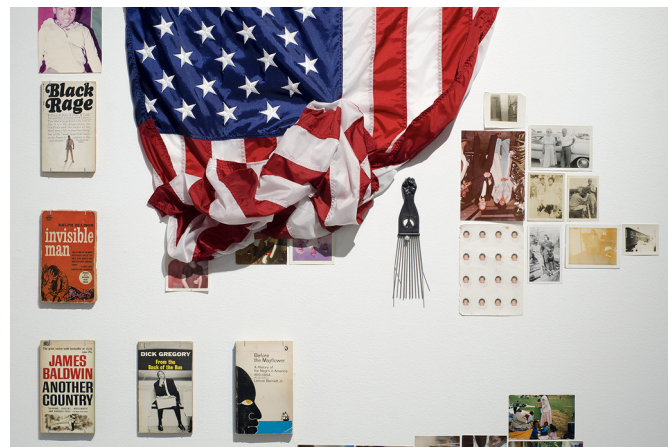
Detail image of No Instructions for Assembly , a solo installation at Real Art Ways in Hartford, CT (2016)

Now that I'm an adult, what's really interesting is thinking about the ways that I worked as a very young person, and how they're very similar to the ways I work now.